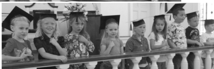
Bubby Bears 4 & 5 Year-Olds