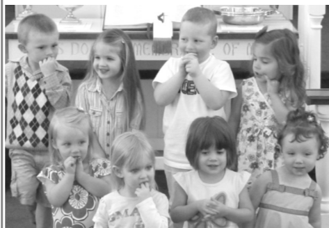
Busy Bees (2 yr.-olds)

On Tuesday, May 17, the Mother's Day Out Graduation was held in the sanctuary followed with refreshments in the Fellowship Hall. Two groups of 4 & 5 yr.-olds graduated and will be enrolled in Kindergarten next fall. We wish them much love and happiness!