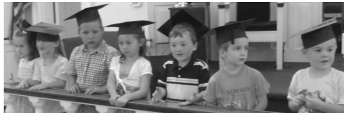
Faithful Frogs 4 & 5 Year-Olds