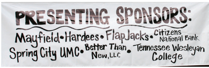
Those who gave $1000.00 to the Camp tournament