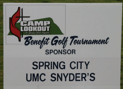
Recognition of hole sponsorships