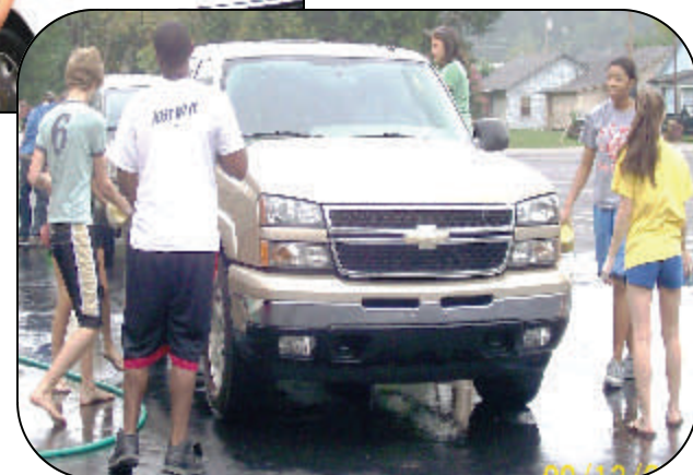
Car washing scenes from last year.

Youth Car Wash in Church Parking Lot 9:00 a.m. - 1:00 p.m.