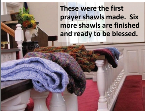
These were the first prayer shawls made. Six more shawls are finished and ready to be blessed.