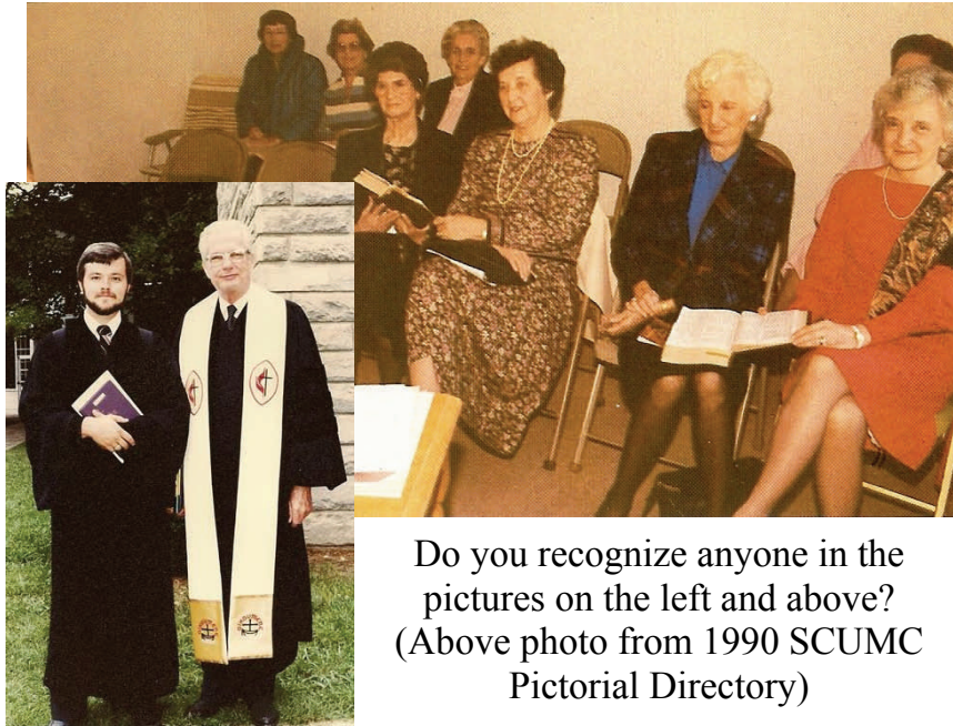
Do you recognize anyone in the pictures on the left and above?