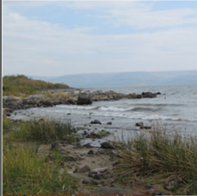
The Sea of Galilee