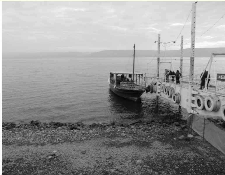
Boarding the Sea of Galilee Worship Boat.