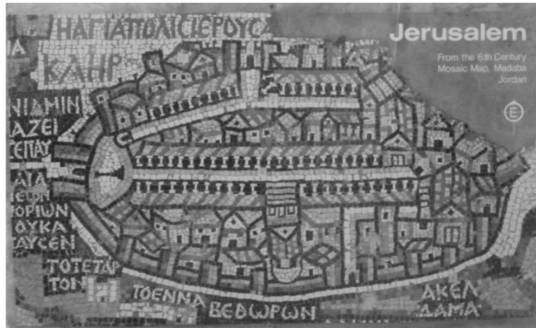
Above is a Mosaic Map of Jerusalem.