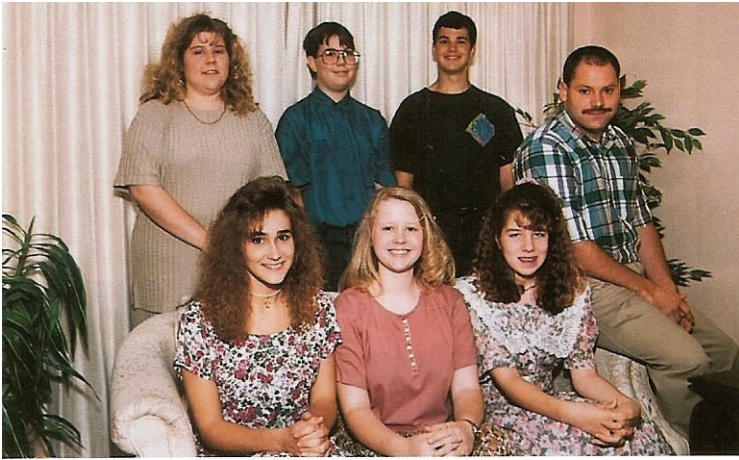
Do you recognize anyone in the picture above?