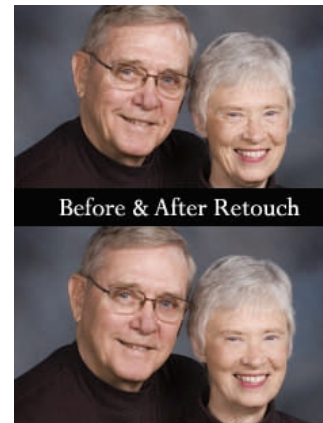
Before & After Retouch